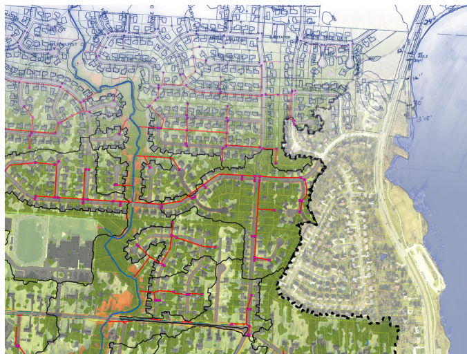
Some types of data in the Stream Resource Database.