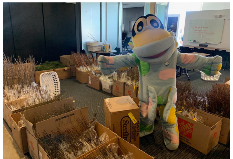
Students from Lead the Way Learning participated in a Franklin Soil & Water-led program that taught them about the importance of water quality and job opportunities in natural resources.

Our Annual Tree & Plant Sale has been providing affordable plants that prevent soil erosion and create habitat to Central Ohioans for decades, and 2023 was one of our largest sales ever! Ohio native plants were the top sellers of the sale, which also included fruit trees, mushrooms, and seed kits. Native plants enhance home landscapes and conservation sites alike by providing incredible benefits for wildlife and absorbing stormwater with their roots.