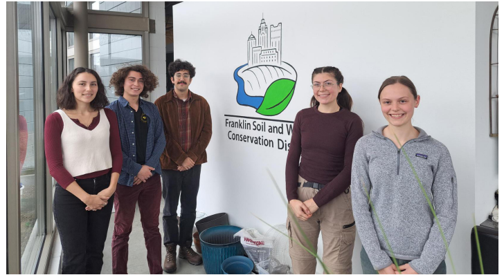
Several members of the Central Ohio Collaborative AmeriCorps Team at the Franklin SWCD.

This year marked the beginning of the Central Ohio Collaborative AmeriCorps program with our partners at Columbus and Franklin County Metro Parks, Green Columbus, FLOW, Grange Insurance Audubon Center, and Stratford Ecological Center to build capacity for these host sites in conservation projects, GIS mapping, and environmental education. AmeriCorps members are managed by Franklin SWCD, but serve at their host site, as well as participate in monthly days of team service including invasive removal and tree plantings.