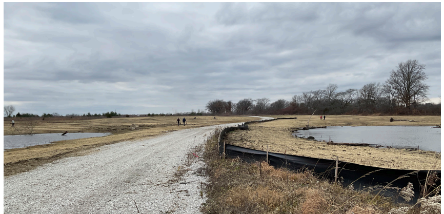
In late 2023 the restored wetlands at Hellbranch Meadows became functional and began to fill with water.

The District implemented a $496,578 H2Ohio grant for wetland restoration at Hellbranch Meadows on the western side of the property. This project restored 11 acres of wetlands and 18 acres of wetland buffer, with approximately 500 trees and shrubs planted (both bare roots and containerized), and approximately 3,000 live stakes planted. We'll be completing this project in May 2024.