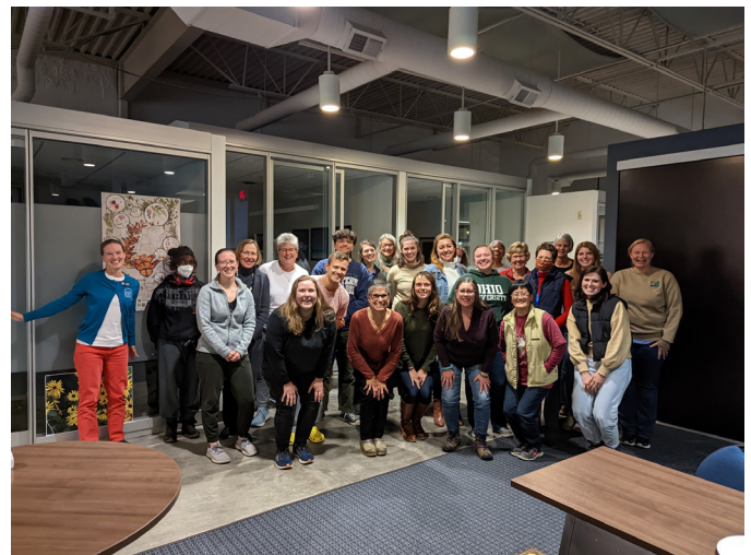
Our 2023 Master Rain Gardener Class included 32 participants from all around the county!