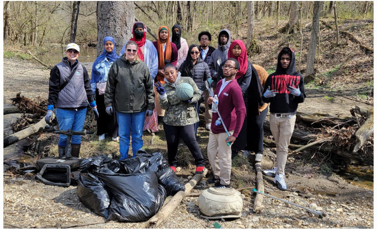
Students from Lead the Way Learning participated in a Franklin Soil & Water-led program that taught them about the importance of water quality and job opportunities in natural resources.

District programs and services are offered on a non-discriminatory basis.