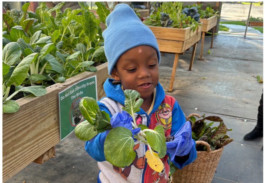
Accessible raised beds increased yields and opportunities at Family Adolescent and Child Community Engagement Service Urban Garden.

This year we had the opportunity to partner with the Franklin County Board of Commissioners to offer a total of $150,000 in grants for small agricultural operations to improve their infrastructure and increase production. From high tunnels to rolling carts for market transportation, this program helped increase local access to healthy food.