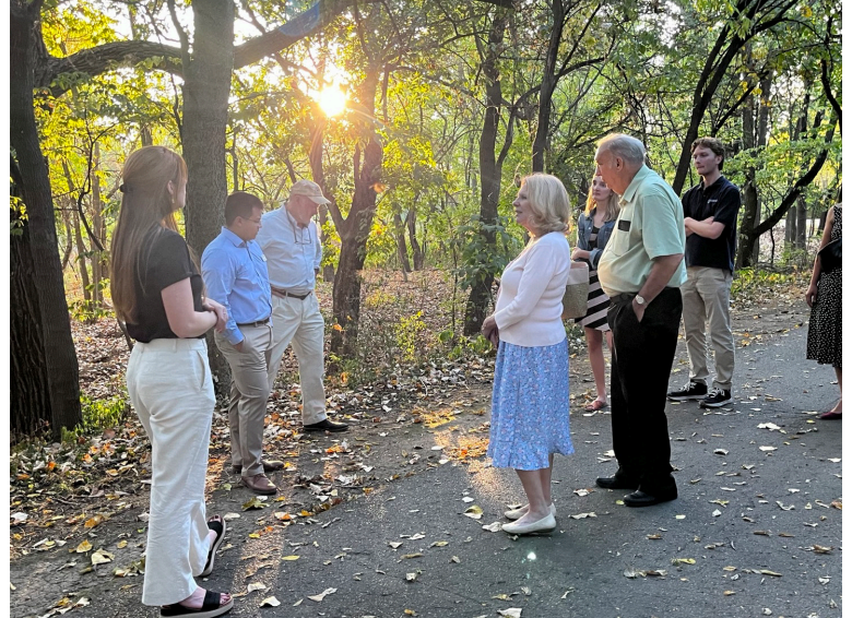
Sponsorship of events like our Annual Meeting (pictured) is a win-win for funding conservation and helping companies promote themselves to Central Ohio's environmental professionals.

District programs and services are offered on a non-discriminatory basis.