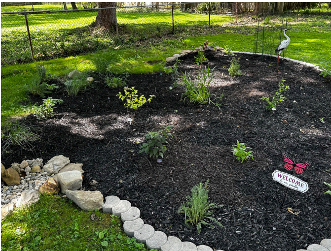
Tammy P's new rain garden in Columbus was funded in part by our rain garden cost-share program.

We provided funding assistance for 12 resident-led rain garden projects. Rain gardens can help control water pollution from nutrients and heavy metals and reduce urban stormwater runoff and peak flow during storm events. Since we began the program, we have helped fund 29 rain gardens in Franklin County thanks to our municipal partners.