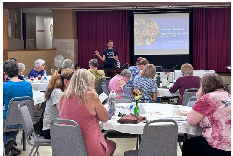
Friends of the Lower Olentangy Watershed facilitates a Community Backyards workshop at Maple Grove United Methodist Church.

We set a new record for our Community Backyards rebate program, with $112,818.92 reimbursed to county residents for the purchase of rain barrels, rain gardens, compost bins and native plants that not only improve soil and water quality, but also save residents money on utilities, increase climate resilience and offset food waste. This program also includes an educational course that reached 3,132 residents in 2024.