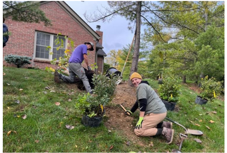
Neighbors in Willow Brook plant native trees and shrubs on a steep hillside in their neighborhood.

Franklin Soil and Water Conservation District partnered with Columbus Recreation and Parks Department to develop the Columbus Urban Tree Assistance Program. This program is made possible by funding from Columbus Recreation and Parks Department. Increased tree canopy in urban areas is shown to be associated with positive health outcomes, lower average temperatures, reduced stormwater runoff and increased biodiversity.