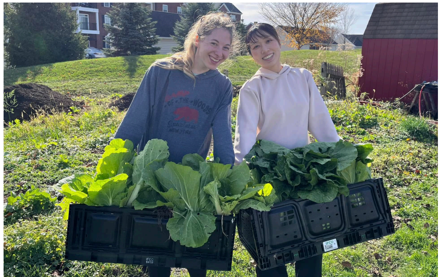
The Urban Agriculture Critical Infrastructure Grant funded an irrigation system at Upper Arlington Lutheran Church, expanding production of food, like this Napa cabbage, that is primarily donated to new American families.

We can't be everywhere at once, so we offer grants for on-the-ground conservation to local community groups. Administering these grants is a lot more than just signing checks! Our staff work closely with every community group that's awarded a grant to make sure projects follow the latest scientific guidance, have the largest possible impact and are maintained long term.