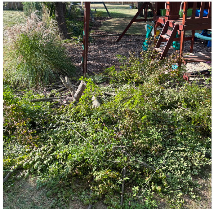
An invasive Burning Bush ( Euonymus alatus ) lies destroyed before being replaced with a native plant through the Invasive Trade In program.