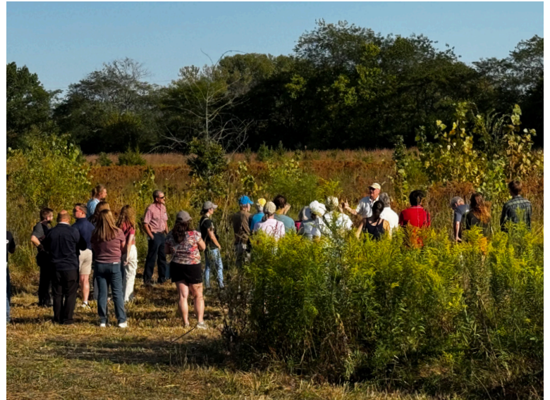
Sponsorship of events like our Annual Meeting (pictured) is a win-win for funding conservation and helping companies promote themselves to Central Ohio's environmental professionals.

District programs and services are offered on a non-discriminatory basis.